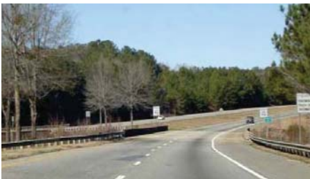
Northern view of the I-185 Scenic Byway