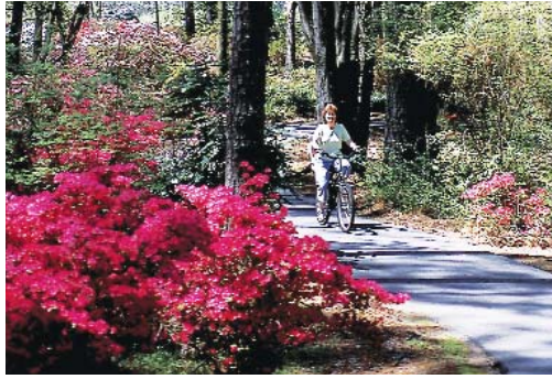
Callaway Gardens is located 6.5 miles from the I-185 Scenic Byway.

Beyond the designated route of the I-185 Scenic Byway is a rich network