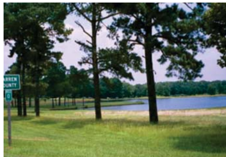
Scenic view along SR 16 at the Warren-Hancock County line.

The Warren-County Piedmont Scenic Byway Extension is a 15-mile route that begins at the Hancock County line at Jewell and continues east on State Route 16 to the City of Warrenton. The byway passes through a wildlife management area, farmland, rivers, and historic properties. It serves as a continuation of the Historic Piedmont Scenic Byway (located in Putnam and Hancock counties).